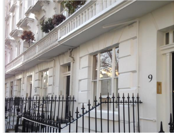
SECTION 20 WORKS