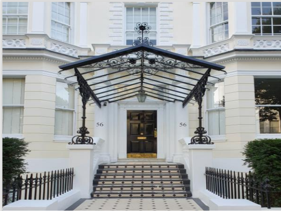
INTERNAL COMMUNAL REFURBISHMENT