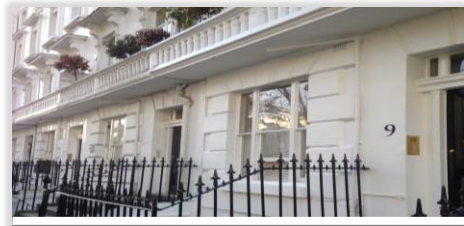
SECTION 20 WORKS