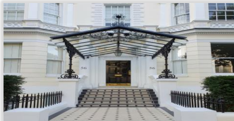
INTERNAL COMMUNAL REFURBISHMENT